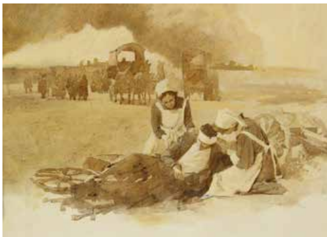
Roses of No Man's Land