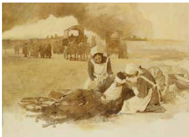
Roses of No Man's Land