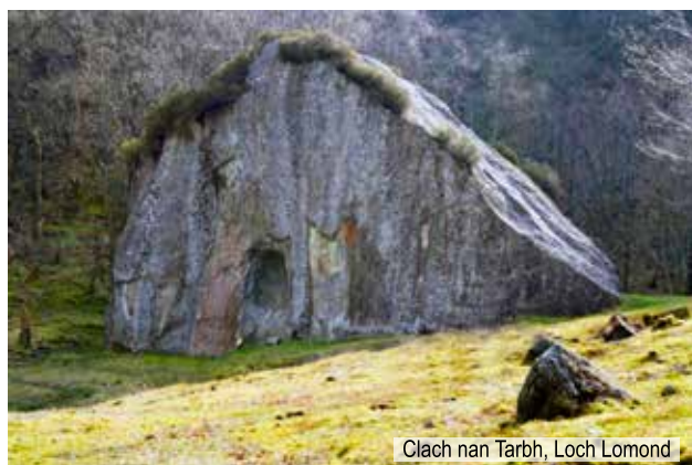
Clach nan Tarbh, Loch Lomond

Clach nan Tarbh, or "The Stone of the Bulls," is near Loch Lomond, and takes its name from a legend of two bulls having dislodged it during a fight. During the early 19th century a platform was cut into the rock so that a minister might conduct services, hence its alternative name, The Pulpit Rock.