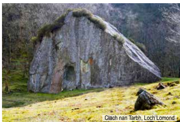
Clach nan Tarbh, Loch Lomond

Clach nan Tarbh, or "The Stone of the Bulls," is near Loch Lomond, and takes its name from a legend of two bulls having dislodged it during a fight. During the early 19th century a platform was cut into the rock so that a minister might conduct services, hence its alternative name, The Pulpit Rock.