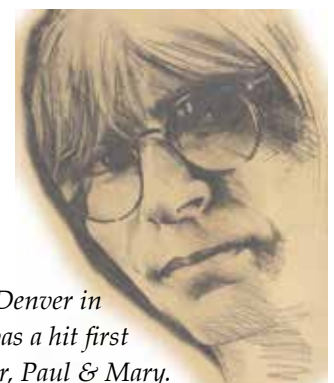
Written by John Denver in 1966, this song was a hit first by Peter, Paul & Mary.