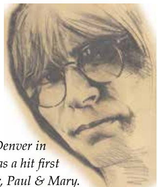
Written by John Denver in 1966, this song was a hit first by Peter, Paul & Mary.