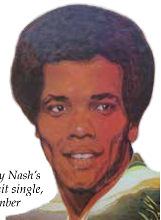
Johnny Nash's biggest hit single, reaching number 1 in 1972.