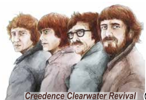
Creedence Clearwater Revival