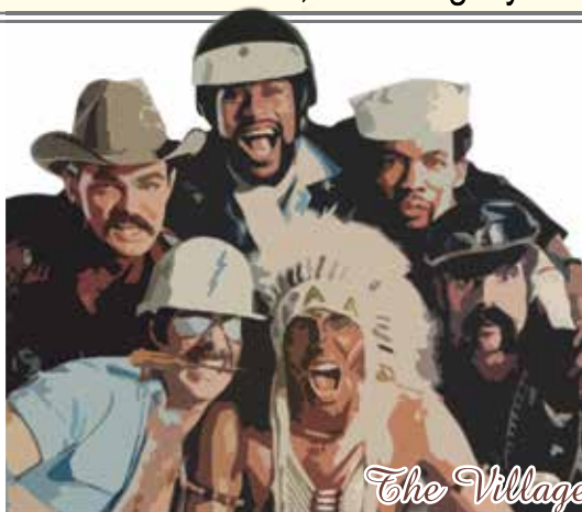
The Village People