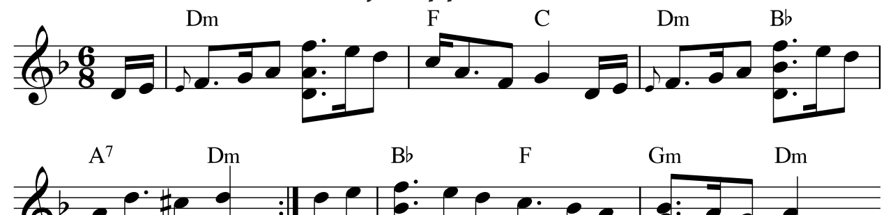
Archibald MacDonald of Keppoch (traditional) slow air