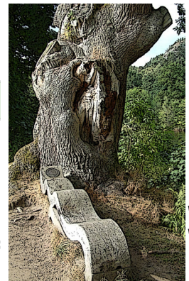
Niel Gow's Oak, or "the fiddle tree", where the famous fiddler would sit and compose tunes.

C— G7— C— Oh no more will I rove no more, it's done.—