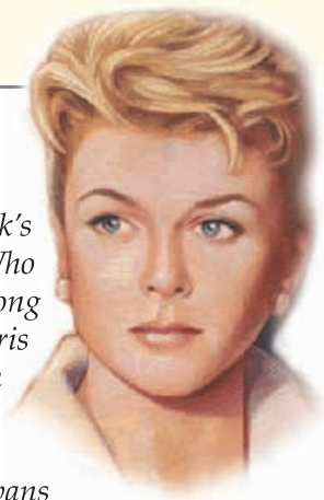
1-4: Que Sera Sera

First heard in Hitchcock's 1956 film "The Man Who Knew Too Much", this song was a big hit for Doris Day, who also acted in that film. It was written by Jay Livingston and Ray Evans