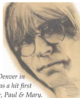
Written by John Denver in 1966, this song was a hit first by Peter, Paul & Mary.